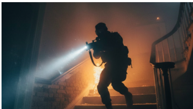
Operation Nimrod - The SAS in Action

Please note : For a small additional fee I can bring life-size replica examples of SAS weapons and equipment. Just ask when you book.