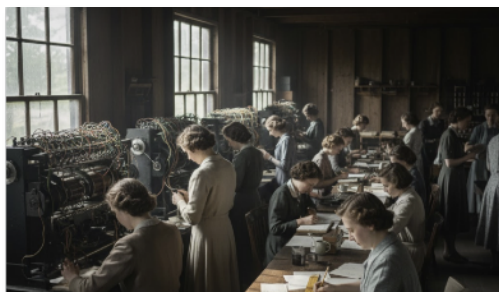
The Bletchley Girls How 8000 Women Outsmarted Enigma

They didn't just file papers; they were the mathematicians, the linguists, and the operators who broke the back of the German war machine.